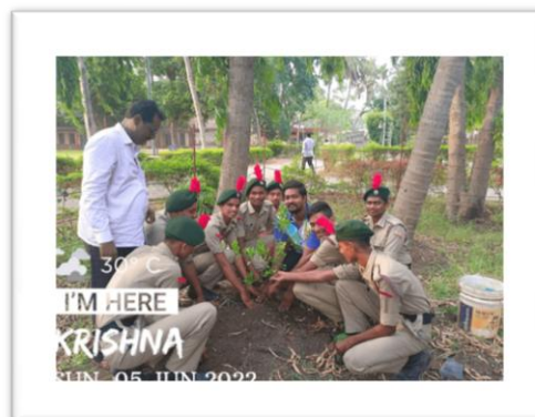
World environmental day celebrations