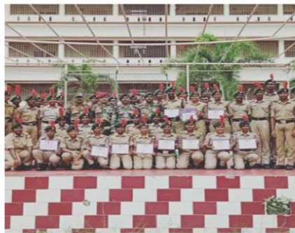
Annual training camp

5. The NCC cadets participated in the Annual Training Camp at Sri Viswashanthi E.M High School, Vuyyuru, and secured various prizes in competitions held on August 26,2022.